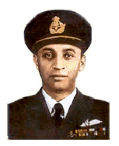
Air Marshal Subroto Mukerjee, OBE

Air Marshal Subroto Mukerjee OBE (05 Mar 1911- 08 Nov 1960) lived a life of determination, dedication and total commitment to the cause of the service that he guided from its inception until its transformation into the Air Arm of independent India. In the early 1930's, when the British government in India could no longer ignore the growing demands of the Indian people for greater representation in the higher ranks of the defence services, it grudgingly began the process of 'Indianisation' of the services. As a result, the Indian Air Force (IAF) came into being on 08 October 1932.